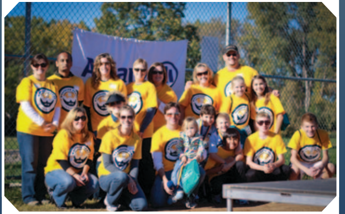
Washburn Games

Allianz sponsored the inaugural event at the gold level. Success Computer Consulting supported the event at the silver level and 15 other Twin Cities companies also donated to make the event possible.